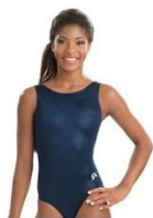
Older Girls and Boys